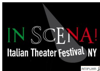
The In Scena! Festival was inaugurated last year as an official event of "2013 Year of Italian Culture" in the USA, under the auspices of the President of the Italian Republic with the Patronage of the Ministry of Foreign Affairs and the Embassy of Italy in Washington, D.C. Events were mounted in all five boroughs and included three full productions that were US premieres, three special events and four staged readings, all playing to full houses. In Scena! is Italian for "on stage!" This year, six full productions and four readings are planned. All events will be bilingual.

Kairos Italy Theater, the preeminent Italian theater company in NYC, present its second In Scena! Italian Theater Festival ( www.inscenany.com ) in all five boroughs from June 9 to 24, 2014. The event will feature six full productions and four readings. Production highlights include "Hanno tutti ragione" (Everybody's Right), performed by Iaia Forte, a leading actress in Paolo Sorrentino's film "The Great Beauty" (Best Foreign Language Film, 2014 Academy Awards). The play is based on a book by Sorrentino. Other programming highlights include a series of plays and readings dealing with soccer, celebrating the 2014 Soccer World Cup.